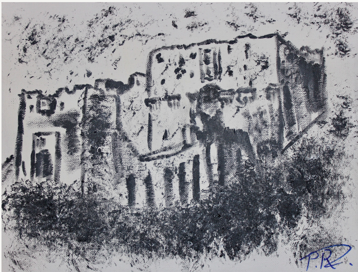
Aleppo Castle before bombardment, drawn by a Syrian who was born and lived in Aleppo before coming to Kingston as a refugee.