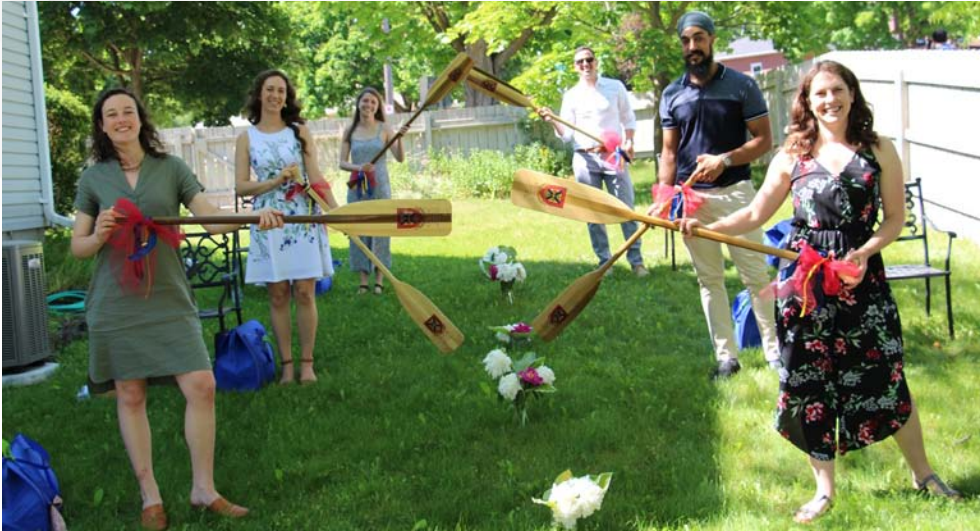
PK residents celebrate their graduation in June 2020, physical-distance style, with the paddles they received as gifts.

“I am incredibly lucky to be a PGY1 in the Queen’s DFM PK residency program! Queen’s was my first choice, and it has lived up to all of my expectations, despite the hiccups of COVID.