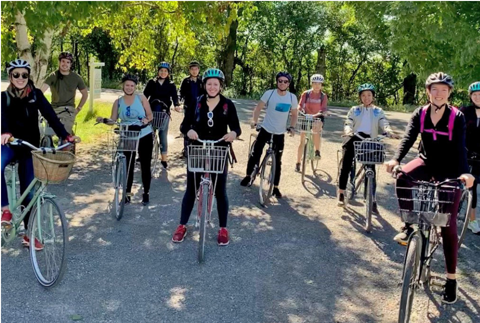
BQ residents enjoy a ride through beautiful Prince Edward County